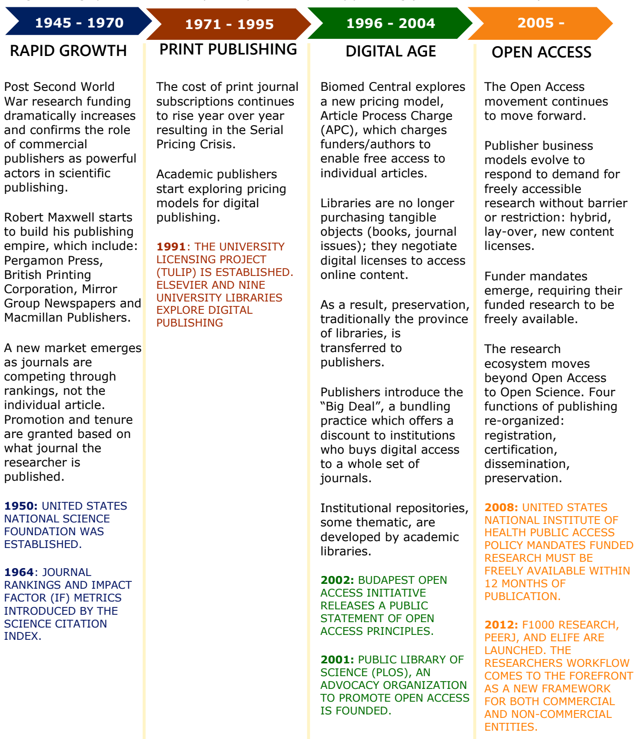
Figure 1: A graphical timeline of key developments in scholarly publishing

the number of journals, and in the rapid rise of subscription prices meant that individual subscribers gradually dropped out; library purchasing became the dominant source of revenue for publishers. From the 1960s onwards – even as commercial publishers became increasingly dominant - libraries faced increasing financial difficulties. By the 1980s, talk of a ‘serials crisis’ became widespread 7 .